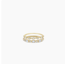
925 Sterling Silver Diamond and White Topaz Band Set $99.00