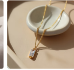
1 CT Cubic Zirconia 18 Inch Long Sterling Silver Euphoria Necklace $99.00