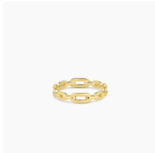
925 Sterling Silver Parker Link Band $99.00