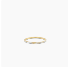
925 Sterling Silver Diamond Bar Eternity Band $99.00