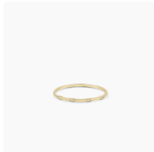
925 Sterling Silver Diamond Stacking Band $99.00