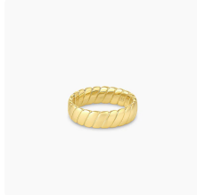
925 Sterling Silver Laney Band $99.00