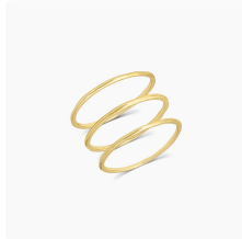
925 Sterling Silver G Band Set $99.00