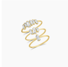
925 Sterling Silver Amara Band Set $99.00