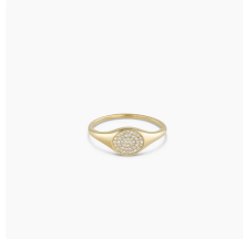
925 Sterling Silver Diamond Pavé Signet Band $99.00